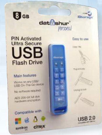
datAshur Personal in retail packaging